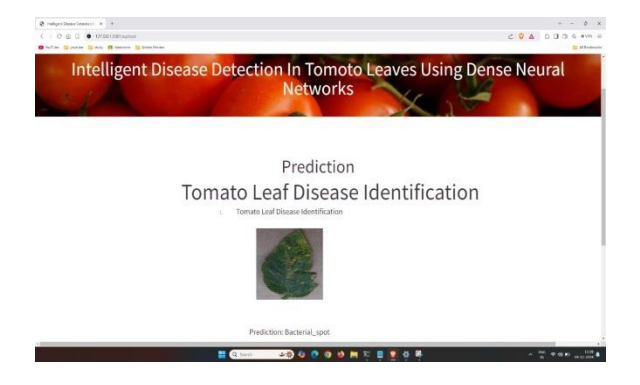
Fig: Disease Prediction