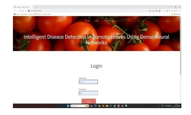
Fig: User login page