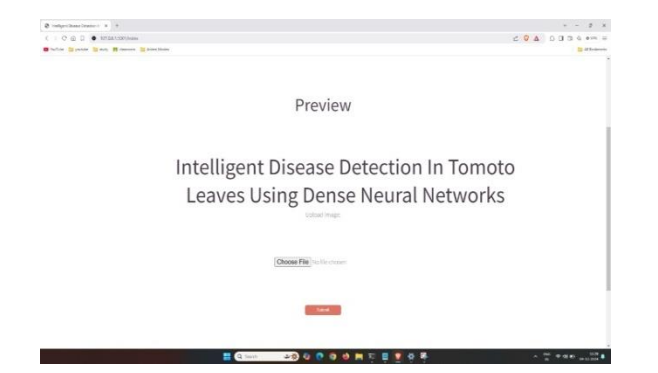
Fig: Choose a file to upload