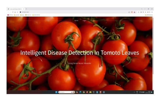
Fig: Disease detection welcome page