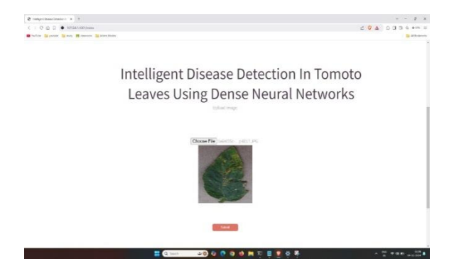
Fig: Image Uploaded