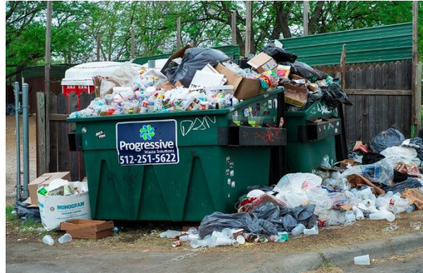
Figure 1. Overflow Garbage create pollution

The management of the waste that is produced daily is a major issue that practically all cities face. Currently, corporation cars are required to empty the bin on a daily basis along a predetermined path. Occasionally, the bin will be overflowing with waste, which attracts dogs and cattle. These animals will cause the garbage to pour into the road. Due to overfilled bins, individuals won't approach trash cans to dispose of their waste; as a result, total automation is required so that concerned parties can remotely monitor the trash cans and alert the collection vehicle to empty them when they are full, saving fuel and preventing waste spills.