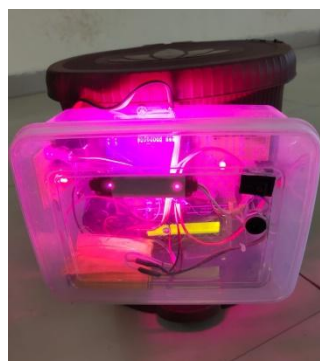
Figure 4. Project Image

We displayed a clear social event waste structure. The IoT recognition model is dependent on the structure. It is in charge of estimating the amount of rubbish in the trash cans and sending that information (over the Internet) to a server for processing at a remote location. This information calculates the updated expert collecting courses. In the future, we'll need to make the structure better for different types of waste, especially strong and fluid waste. By comprehending this task, we may keep a strategic distance from the pollution caused by dustbins and moreover reduce or avoid the shocking stench due to the difficulty before its decomposition.