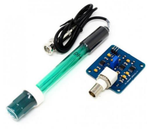
Figure: 7: Soil Ph Sensor

The analog pH sensor kit has a simple, convenient and practical connections and features. It features an LED that acts as a power indicator, a BNC connector, and a PH 2.0 sensor interface. To use it, simply connect the pH sensor to the BND connector and the PH 2.0 interface to the analog input connector of any controller. If pre-programmed, you can easily get the pH. Comes in a compact plastic box with foam inserts for easy portability