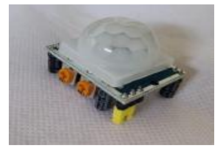
Fig 5: Passive Infrared Sensor