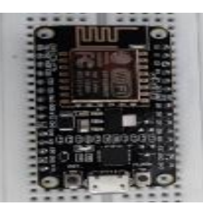
Fig 3: NodeMCU