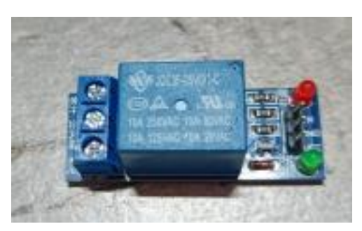
Fig 4: Relay Module

NodeMCU (Fig 3) is an open-source IoT platform that includes firmware that runs on the ESP8266 Wi-Fi module. Programming is done in Arduino IDE using C/C++ language or Lua script. NodeMCU has 16 GPIO pins which can be used to control other peripheral devices like sensors, LEDs, switches, etc. These pins can also be used as PWM pins. It has two UART interfaces and uses the XTOS operating system. It can store 4M Bytes of data. The operating voltage of NodeMCU is 5V. It uses L106 32-bit processor, and the processor's speed is 160MHz.