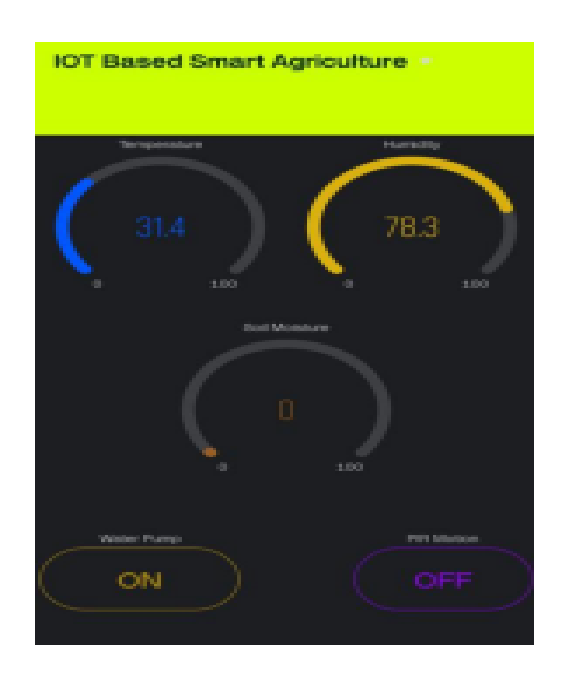
Fig 9: Implementation Demonstration

[245]: data = np.array([[104,18, 30, 23.603016, 60.3, 6.7, 140.91]]) prediction = RF.predict(data) print(prediction) ['coffee'] [246]: data = np.array([[83, 45, 60, 28, 70.3, 7.0, 150.9]]) prediction = RF.predict(data) print(prediction) ['juta'] [247]: data = np.array([[230,42, 43, 82.603016, 82.3, 6.7, 202000.91]]) prediction = RF.predict(data) print(prediction) ['rica'] Fig 8: Model Prediction