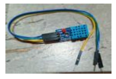
Fig 2: Temperature and Humidity Sensor