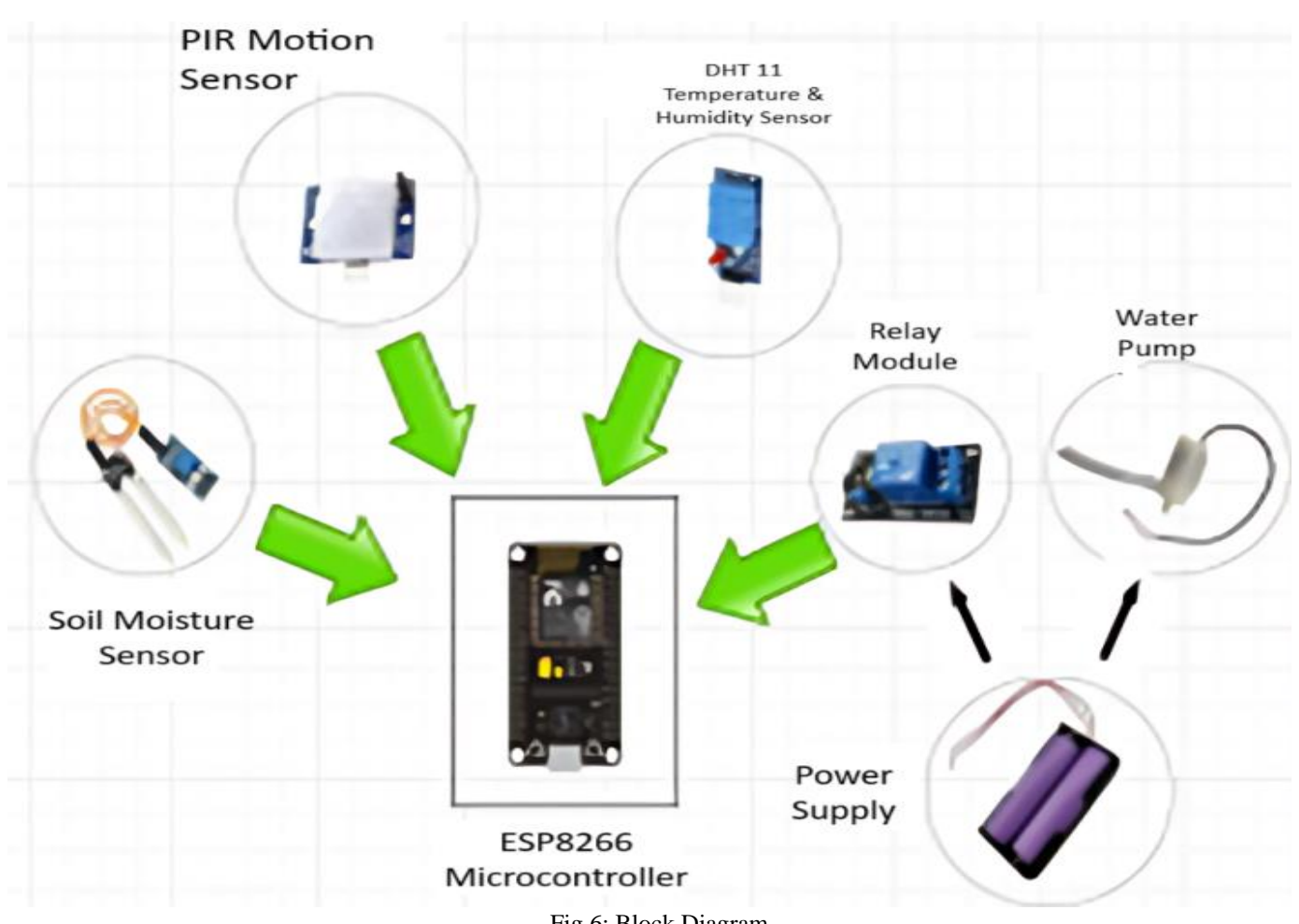
Fig 6: Block Diagram