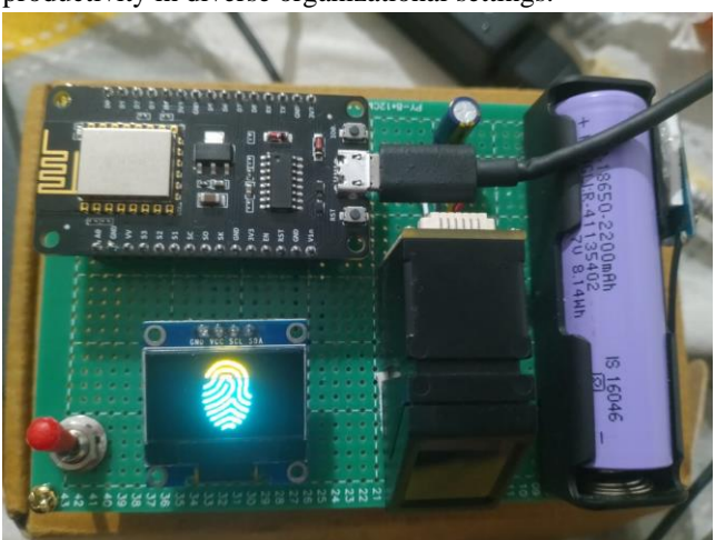
Fig.1.3 smart iot based attendance management system

Furthermore, the NodeMCU ESP8266-based solution offers versatility scalability, accommodating different and environments and scales of operation. Equipped with sensors or RFID modules, the system can accurately identify individuals as they enter or exit a designated area, automatically updating the attendance database. Additionally, the integration of cloud-based storage facilitates convenient data management analysis, enabling administrators comprehensive attendance reports effortlessly. Overall, the IoT-based Smart Attendance Management System utilizing NodeMCU ESP8266 not only streamlines the attendance tracking process but also enhances overall efficiency and productivity in diverse organizational settings.