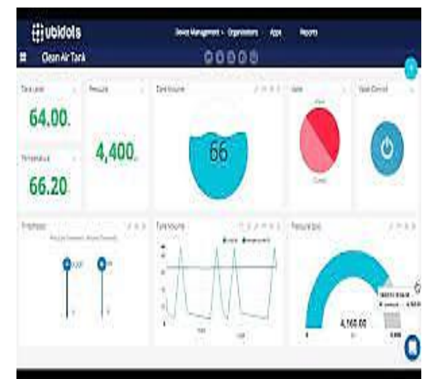
FIG 2. DISPLAY OF VALUES IN UBIDOTS

The patient's heart rate, temperature, blood oxygen saturation level are finally displayed in the IOT platform (UBIDOTS) and in the LCD display, Where the caretaker can monitor the patient's health and to avoid continuously monitoring from same place.