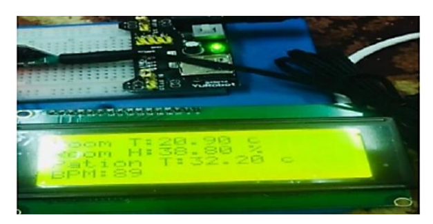
FIG 3. DISPLAY OF VALUES IN LCD