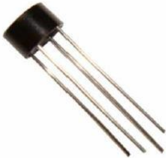
7805 voltage regulator