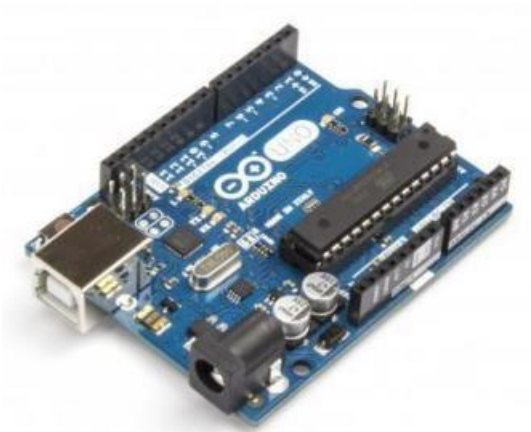
Arduino UNO board

Arduino is open source and single board architecture microcontrollers. Arduino Uno is used to produce display according to fault by executing program loaded into it.