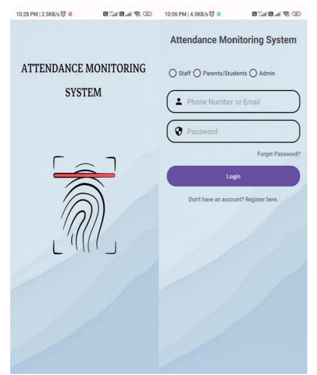
Figure 1. First & Login Page of Embedded Software

In our proposed system, we have given an access control to access the biometric system with an embedded application. Every period the status of the student's attendance information will be sent to their respective parents' mobile. Thus, the main objective is to make the regularity of the students and reduce the paper and logbook traditional method. All the data about the student's attendance will be stored in the given software and the attendance percentage will be calculated automatically so there will be no need for any separate application.