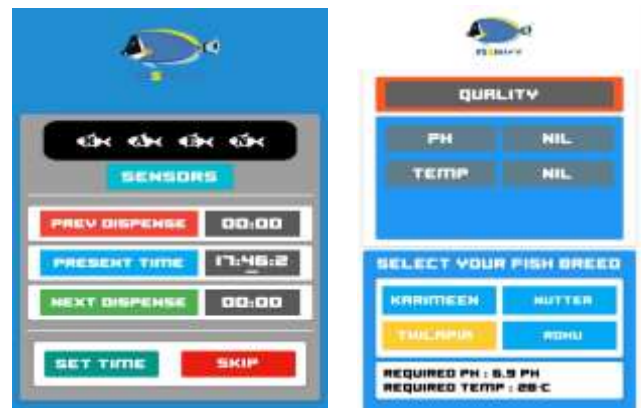
Fig.3. App Screenshot -Dashboard And Feeder Settings

The system architecture of the proposed IoT-Enabled Aquaculture Management System is designed as an integrated framework consisting of sensing, processing, control, and communication layers. At the core of the architecture is the ESP32 microcontroller, which acts as the central control unit. The sensing layer includes pH, turbidity, and DS18B20 temperature sensors that continuously monitor critical water quality parameters. These sensors transmit real-time data to the ESP32, where the values are processed and compared with predefined threshold levels.