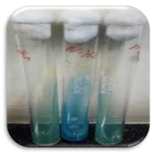
Figure 1-CITRATE TEST