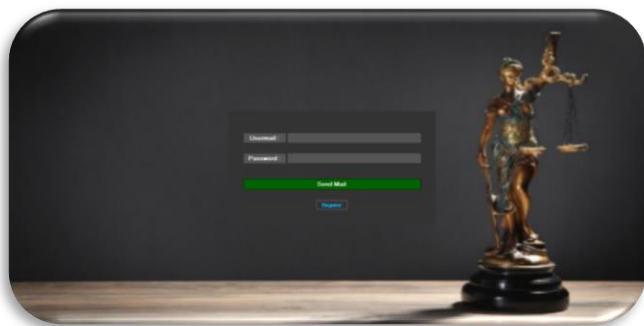
Figure 1: Login Page

This is login page of application by using this we can enter in the application; here we provide a password which is sent on your email which you enter on the registration page.