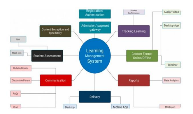
Fig 1. LMS

Our study is needed to address these gaps in the existing research and contribute to a deeper understanding of LMS. Specifically, our study will focus on exploring the pedagogical approaches that can be used in LMS to support Performance: React is known for its performance and personalized and adaptive learning, as well as investigating the user experience and evaluating LMS from multiple stakeholder perspectives.