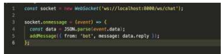
Figure 2: javascript