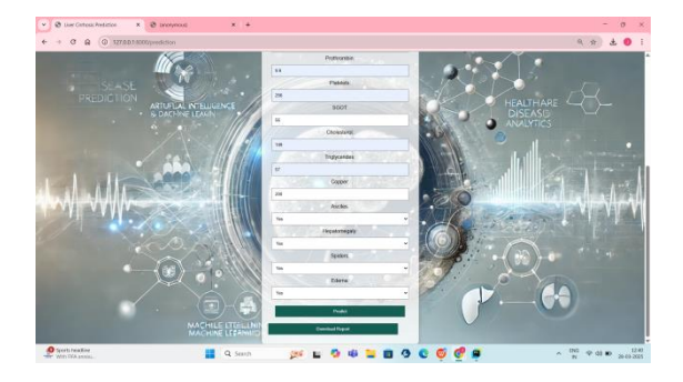
Fig 2 Prediction Page

After entering all the necessary details, users can hit the "Predict" button, which activates the machine learning model to analyze the data. The model quickly processes the information and gives an immediate prediction about the stage of liver cirrhosis.