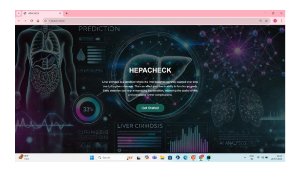
Fig 1 Home Page

guided to the prediction page, where they can input important information about the patient.