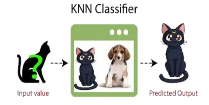
Figure 3 : KNN classifier sample output

Consider the case when we have a photo of a creature that resembles both cats and dogs but we are unsure of which it is. However, since the K nearest neighbour method is based on a similarity measure, we may use it for this identification. By comparing the new data set's characteristics with those shown in pictures of cats and dogs, our K nearest neighbour model will identify whether the new data set is a cat or dog.