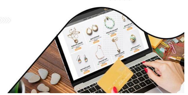
Fig -1: Figure