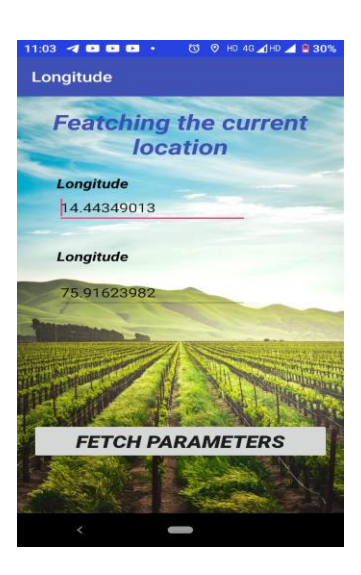
Figure 3: Screen showing the current location fetched from GPS