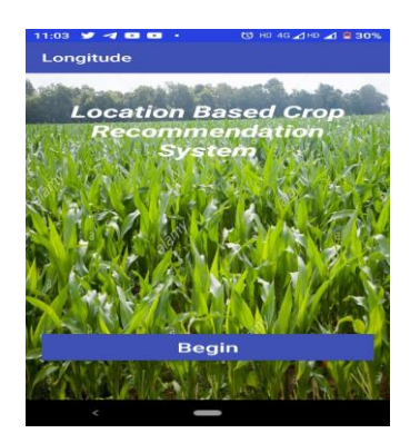
Figure 2: First screen of the app

© 2022, IJSREM | <u>www.ijsrem.com</u> DOI: 10.55041/IJSREM12299 | Page 3