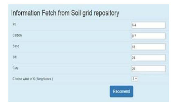
Figure 4: Soil parameters fetched from Soil grid using Geo location