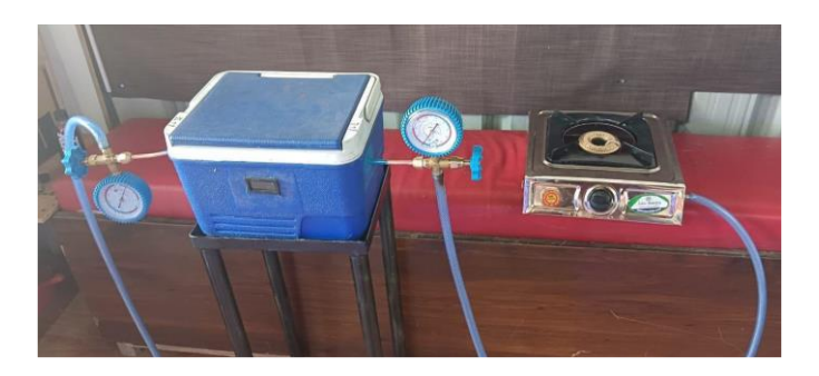
Fig -2: Setup of LPG Refrigeration

High pressure regulators are specifically used to send high-pressure gas from cylinders, often for functions such as Bhatti stoves.