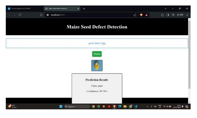
Figure 3: Classified Output