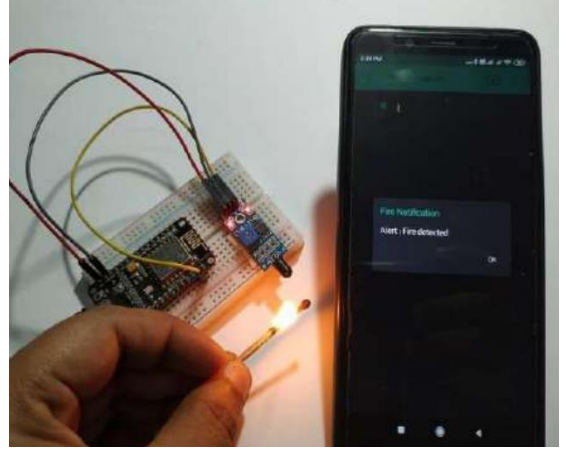
Fig -1: Result Of Fire Detection system

The language used to build up the coding is C 0 language. C language is a common language used in coding, computer programming, structured programming, and recursion. The system is first programmed to read the readings from the temperature and humidity sensor. Once it gets the reading from the sensor, it will start to evaluate the temperature value and the humidity level either the temperature or the humidity level are in the standard level. The expected result is shown in Table 1. All the temperature and humidity values are sent to the online database through the Blynk platform, so that all the data can be recorded and reviewed. The database used is on firebase which is a mobile and a web application development platform.