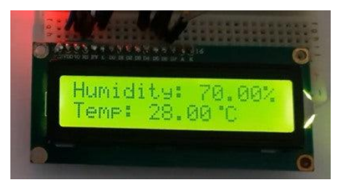
Fig -3: LCD readings

Figure 3 shows the LCD display with the temperature and humidity values displayed. The microcontroller interfaces the temperature and humidity sensor (DHT 11) and a relay which is used to control the load (humidifier). Table 2 shows the LCD display which corresponds to the system operations.