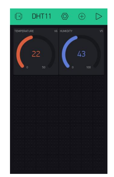
Fig -5: Mobile application displays real-time value

The data from database is taken through the Blynk platform and displayed on the mobile application. This IoT function allows us to get the temperature and humidity level through wireless communication no matter where we are. Figure 5 shows the real-time database update of the application. The application will refresh itself every 3s.