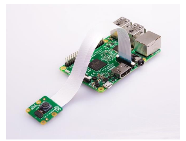
Fig: raspberry pi camera module

convenience, boasting an advanced facial recognition system. This innovative feature adds a layer of sophistication to the mirror's functionality, allowing it to greet users by name as they approach and customize their experience based on individual preferences. With a quick glance, the mirror seamlessly identifies users, unlocking a tailored interface that may include personalized reminders, favorite music playlists, or even skincare recommendations based on previous interactions. Beyond its practical applications, facial recognition imbues the mirror with a sense of intimacy, creating a truly personalized and immersive experience that blurs the lines between technology and everyday life.