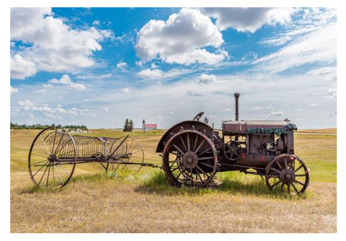
Fig: 1.3 First rubber tractor tyre

The steel lugs proved to be a double-edged sword. They were good in the field for traction but did little to solve issues of soil compaction. That significant weight, when driven onto the fledgling road systems being developed in many countries, would crack and damage the roads. So much so, the lugs either had to be removed before travelling on them or covered with steel protection (no doubt adding more weight). At worst, it simply didn't prevent some road damage. At best, it was time-consuming and annoying.