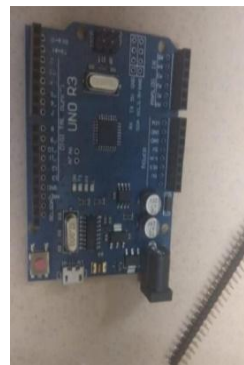
Fig. 6 Arduino-UNO

This microcontroller board, which is based on the Atmega328, was created by Arduino. cc. Microcontrollers are a common component of embedded systems, enabling gadgets to function in accordance with our specifications. The Arduino Uno, which has an Atmega328 microprocessor, 14 digital I/O pins, 6 analog pins, and a USB interface, is a very useful addition to the electronics world. Using the Tx and Rx pins, serial communication is also supported. This project uses an Arduino UNO to control a servo motor. Arduino is used to control the servo motor's direction.