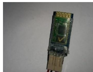
Fig. 7. Bluetooth

Bluetooth is a wireless technology standard that allows the creation of personal area networks (PANs) and the exchange of data over short distances between fixed and mobile devices using short-wavelength UHF radio waves in the industrial, scientific, and medical radio bands, from 2.400 to 2.485 GHz. To regulate motion and direction, this project uses Bluetooth to connect to a mobile device.