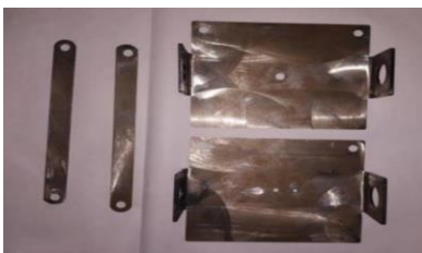
Fig. 2. Base Plate and Frames

Four frames that are affixed vertically to the base plate make up the model. Mild steel is used to make both the frames and the base plate. Mild steel is a lightweight, pliable metal that can have a dull gray or silvery look depending on how rough the surface is. It does not readily ignite and is nonmagnetic. New mild steel films are good reflectors of visible light (around 92%) and outstanding reflectors of medium and far-infrared radiation (up to 98%). Mild steel has a yield strength of 7–11 MPa, but the yield strengths of aluminum alloys range from 200 MPa to 600 MPa. The density and rigidity of mild steel are around one-third that of steel. It is simple to extrude, sketch, cast, and machine. The structure of mild steel is a face-centered cubic (fcc) arrangement of atoms. The stacking-fault energy of mild steel is about 200 mJ/m 2 . With only 30% of copper's density, mild steel has 59% of copper's electrical and thermal conductivity, making it a good thermal and electrical conductor.