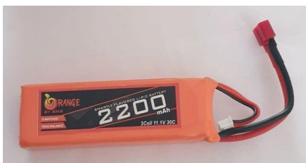
Fig. 4. Battery

One of the crucial components of this process is the battery. This has an electric line connecting it to a DC motor. In order for the vehicle to travel forward and backward, it stores electrical energy and supplies it to the DC motor. Through electrochemical discharge reactions, batteries transform chemical energy into electrical energy. One or more cells, each with a positive electrode, negative electrode, separator, and electrolyte, make up a battery. Primary and secondary are the two main classes into which cells can be classified. Once the reactants are exhausted, primary cells cannot be recharged and must be replaced. Reactants in secondary cells must be recharged using a DC charging source to return to their fully charged condition.