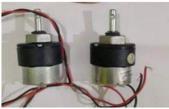
Fig. 3. D.C Motor