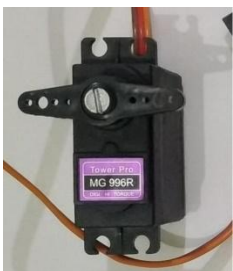
Fig. 5. Servo Motor

Servo Motor In reality, a servo motor is a combination of four components: a gear reduction unit, a control circuit, a position-sensing device, and a standard DC motor. A gear mechanism attached to the DC motor transmits feedback to a position sensor.