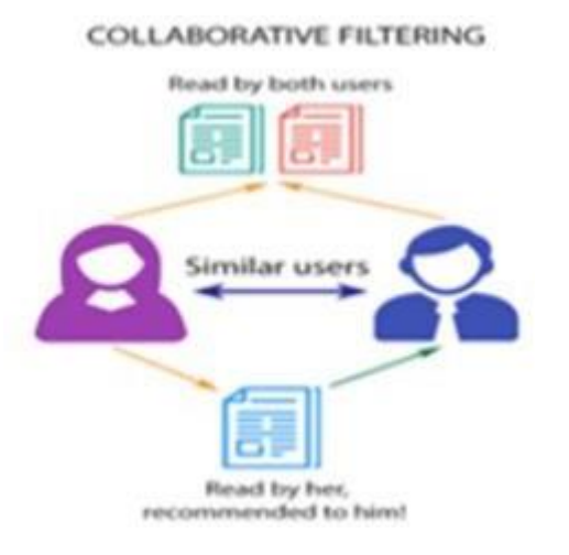
Fig. 2.2: Collaborative Filtering

This technique create a user-item matrix of preferences for items by users. Also, it matches the similarity between the user data and data base, then make recommendations. This filtering used when it is difficult to describes any movie, books, songs by attributes from the data sets.