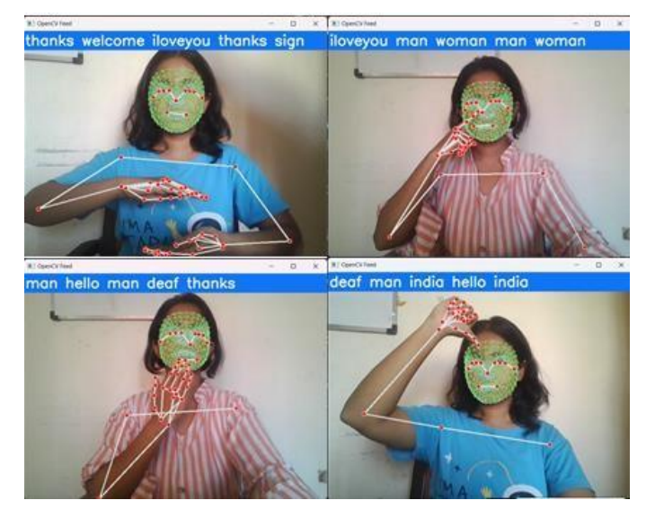
Fig -1: Mediapipe Key points connection

consequently promoting improved inclusivity and accessibility in communication.