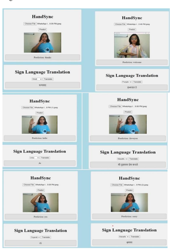
Fig -3: Output

The proposed method's performance evaluation involves an extensive analysis on the efficacy of the suggested sign language recognition system, which combines cutting edge technologies like MediaPipe and LSTM networks. We analyze in detail the system's capacity to translate sign language gestures captured by image input into precise textual output, including translations into some communication languages. The system performs remarkably well in interpreting a range of sign language gestures by utilizing MediaPipe for accurate hand and gesture detection and LSTM networks for sequential data processing. Moreover, adding self-generated datasets with frequently used sign language terms improves the system's vocabulary coverage and recognition accuracy. The results of extensive testing and analysis confirm that the system is effective in enabling sign language users to communicate easily across linguistic barriers.