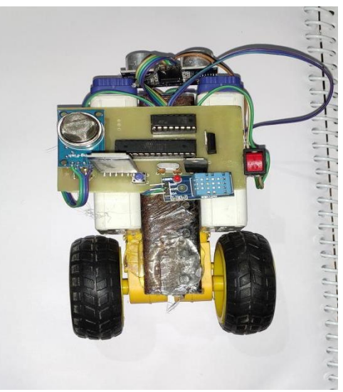
Figure-1: Image of bot