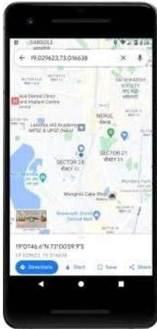
Fig. 4. Message containing URL