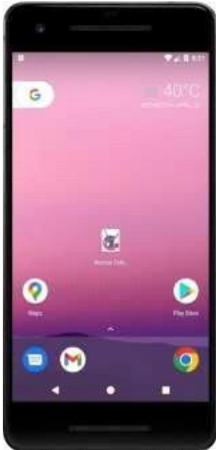
Fig. 2. Home Screen of Device

Upon installation of the application we can see a shortcut of the application on the device home screen.