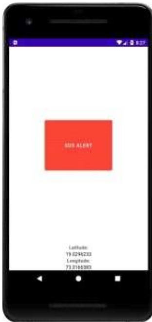
Fig. 3. SOS Alert