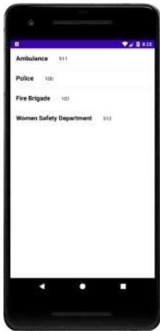
Fig. 7. Helpline Numbers

provided in these module, the call will be sent and the victim will get the help which is required.