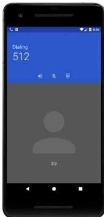
Fig. 10. Direct dialing of call after a single click on number