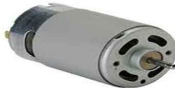
Figure 2: DC Motor

Designed to convert electrical current into force in order to force the workings of a robotic by applying a firm degree of torque to the motor beam. A dc motor is a form of electric motor that transforms electrical energy into mechanical energy.