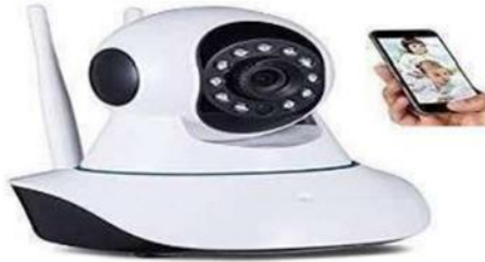
Figure 1: Night Vision Camera

Night visibility: 8 PCS LEDs for IR illumination. Vision extends up to 8 meters at night. Input/Output: Mic&Speaker built-in. Supports bidirectional audio, and simple contact.