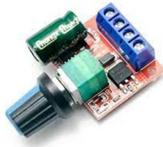
Figure 3 : Motor Driver

Additionally, attach the Raspberry Pi to the Strength Financial Institution. Connect the HDMI cable to the raspberry pi from the VGA to the HDMI converter cable. After that, attach the raspberry pi to a USB mouse and keyboard.