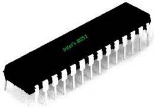
Figure 5 : 8051 Microcontroller

microcontroller by combines a versatile 8-bit CPU with in-system programmable Flash on a monolithic chip, it provides a cost-effective and highly-flexible solution to many embedded control applications.