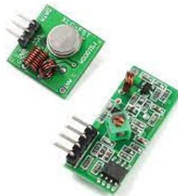
Figure 4: RF Module

RF frequency ranges from around three kHz to 300GHz. this corresponds to the frequency of radio waves and also the AC that carries radio waves. It refers to the ac having such characteristics that if the present is input to Associate in Nursing Associate in Nursing antenna a magnetism field is generated appropriate for wireless broadcast and communication. In order to receive radio signals Associate in Nursing antenna should be used. This antenna can obtain thousands of radio waves at a time and for a similar, we want to use a radio tuner to tune into a selected frequency. This is done by using a resonator.