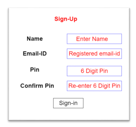
Fig -2: Sign up page

Forgiven application it is necessary to have a security system where each user can store the data as required. To provide such functionality a signup page is employed. The signup page collects the information about the user mainly the user-id and password. In this application, we have employed a PIN which consists of six digits number as a password to provide easy sign-in access. Once the user has successfully registered,