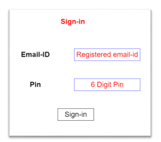
Fig -1: Sign-in page