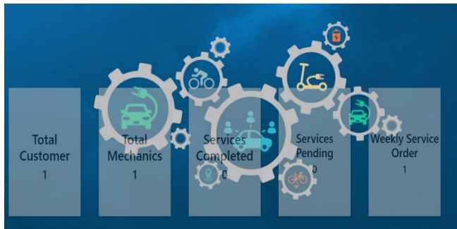
Fig. 2: Number of all the users registered

The On-road vehicle breakdown assistance system admin is in charge of doing the checks for the authentication page, where they are treated as users, and the registration page is also checked for any blank fields. The module specification is done based on the Unit & Integrated testing. Testing is an important factor for any system so as to provide security and any kind of malpractices. It could be a type of program testing that approves the code against useful requirements/specifications. The reason for useful tests is to test each work of the computer program application, by giving suitable input, and confirming the yield against the Utilitarian prerequisites. Test cases also allow us to build the project so that the user can easily understand what details he has to fill in if he has to register or move to a further module.