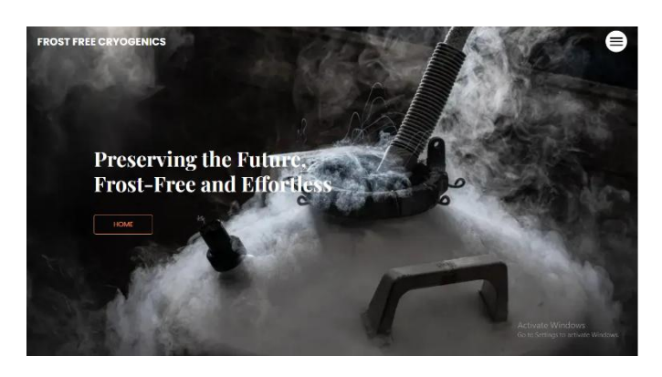
Fig -1: Figure

efficient outcomes. The process delves into understanding how each stakeholder—clients, healthcare professionals, and administrators interacts with the system and ensures that the workflow aligns with real-world expectations.