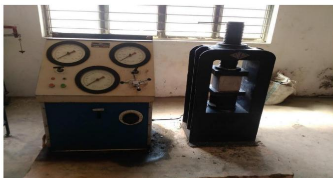
Fig:Compression Testing Machine