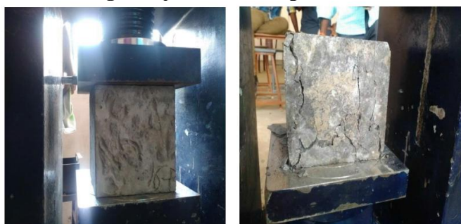
Table:7th Day Compressive Strength of M35Grade Mixes