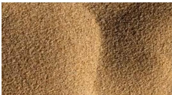
Figure: Fine Aggregate