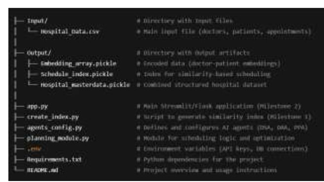
Fig-2 Project Structure.

The modular architecture consists of components[7]: