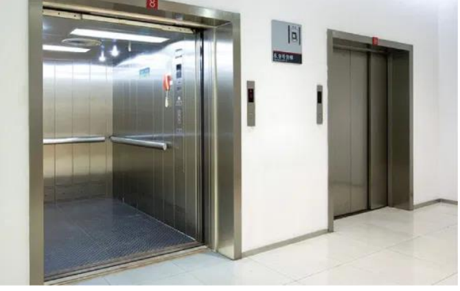
Fig 1: Passenger and Fright Elevators from GENERAL ELEVATOR CO., LTD

Freight Elevators: These are designed to transport goods and heavy equipment between floors, often with larger load capacities and sturdier construction than passenger elevators.