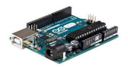
Fig. Arduino Uno

A. Arduino Uno: The Arduino Uno is a microcontroller board based on the ATmega328. It has 20 digital input/output pins (of which 6 can be used as PWM outputs and 6 can be used as analog inputs), a 16 MHz resonator, a USB connection, a power jack, an incircuit system programming (ICSP) header, and a reset button. It contains everything needed to support the microcontroller; simply connect it to a computer with a USB cable or power it with a AC-to-DC adapter or battery to get started. The USB controller chip changed from ATmega8U2 (8K flash) to ATmega16U2 (16K flash). This does not increase the flash or RAM available to sketches. Three new pins were added, all of which are duplicates of previous pins. The I2C pins (A4, A5) have been also been brought out on the side of the board near AREF. There is a IOREF pin next to the reset pin, which is a duplicate of the 5V pin. The reset button is now next to the USB connector, making it more accessible when a shield is used.