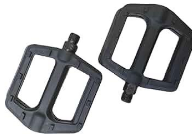
Fig. A bicycle pedal

A bicycle pedal is the part of a bicycle that the rider pushes with their foot to propel the bicycle. It provides the connection between the cyclists' foot or shoe and the crank allowing the leg to turn the bottom bracket spindle and propel the bicycle's wheels. The Size of the pedal is 60mm by 70mm and thickness is 10mm. The size of pedal crank is 250mm in length with the bearing housing provided of 30mm in diameter and internal hole for the driving shaft as 15. The parts will be selected standard.