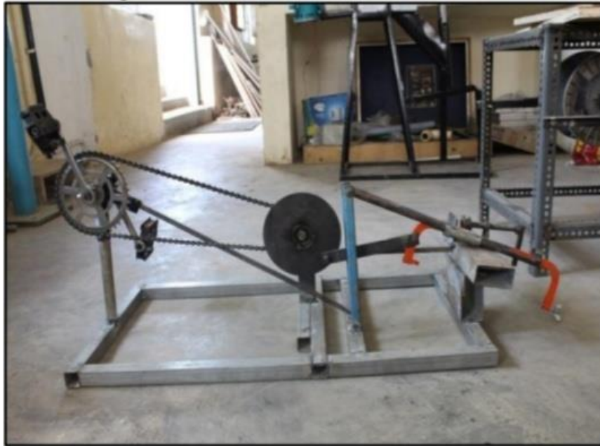
Fig. 4.1 Working