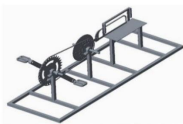
Fig 7. Assembled View of Hacksaw Mechanism.