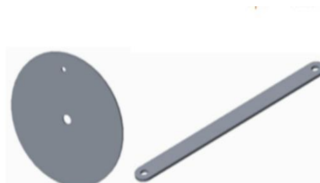
Fig 5. Crank Connecting Rod.

The Crank is connected to the driven shaft of the small sprocket. The speed of small sprocket and crank are same. The Crank will be made of Mild Steel with the diameter as 200mm and the thickness is 3mm. The hole is provided to pivot the rivet with connecting rod.