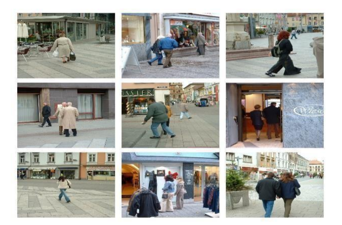
Figure 5.1 College of training images

An extract of the INRIA persons dataset is used to train the model with YOLOv7 tiny architecture. The train dataset consisted of 644 images with annotation files.