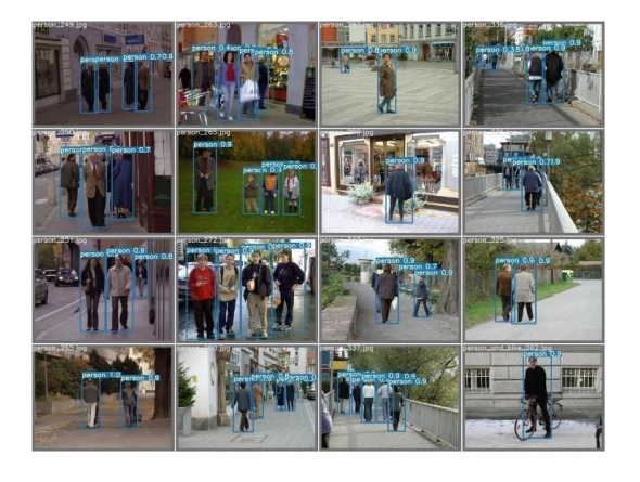
Figure 6.1 Predicted image

Overall, the training and testing of the YOLOv7 model for pedestrian detection represents a significant advance in computer vision research, with important implications for a wide range of real-world applications. As researchers continue to refine and optimize these models, we can expect to see even more sophisticated and powerful computer vision systems in the years ahead.