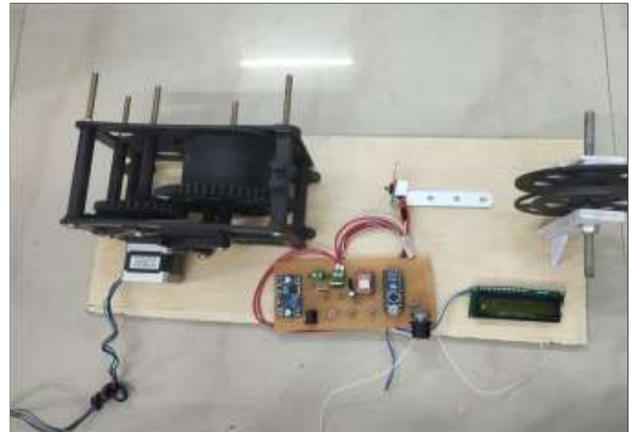
Figure 2: Hardware setup of the PET heating chamber and extrusion nozzle.

ture, set temperature, and system status. A rotary encoder and push buttons allow for precise parameter adjustments. A buck converter is used to step down the input voltage (12V/24V) to 5V to safely power the Arduino and logic components.