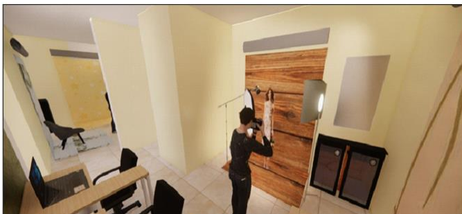
3D view of model area