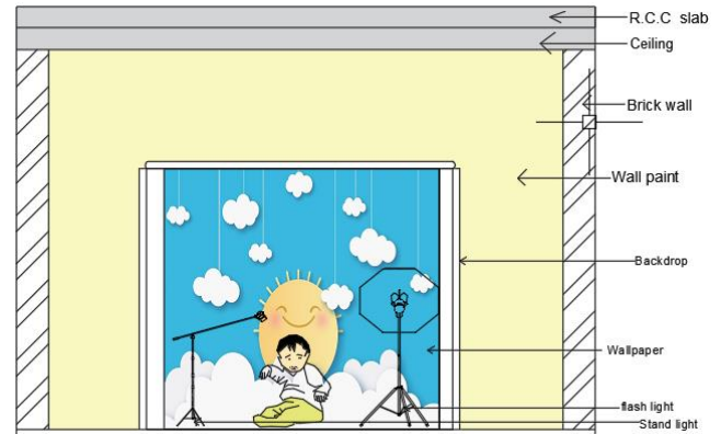
Elevation of baby shoot area

EDITING ROOM – first process that involves the content for the shoot and presentation to purpose of editing is ensure or ideas for the shoot as clearly as possible for focuses the edit the photo for the client .