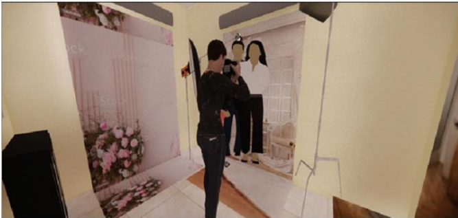
3D view of couple area