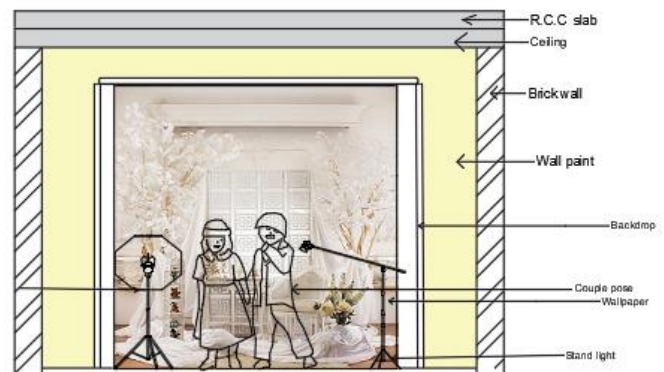
Elevation of couple area