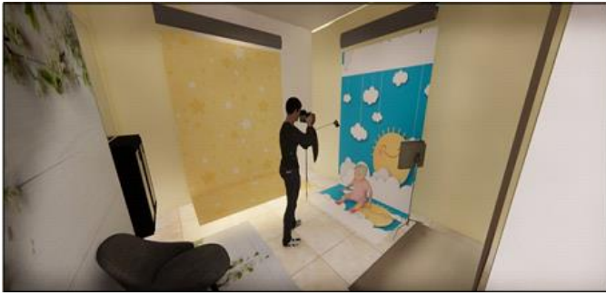
3D view of baby shoot area