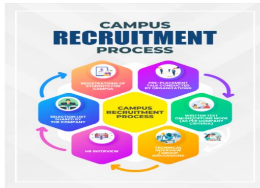
Fig 1.1 Overview

The system comprises 3 major components: