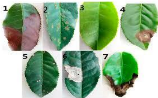
Figure 2: Images of tea leaves having diseases

The discipline of computer vision and machine learning has seen significant breakthroughs recently, and as a result, there is increasing interest in creating automated systems for the identification and categorization of plant diseases. These systems use digital image analysis techniques to identify typical symptoms associated with different diseases by analysing photographs of plant leaves. These systems may learn to identify patterns in the photos and make highly accurate distinctions between healthy and unhealthy plants by utilising machine learning algorithms.