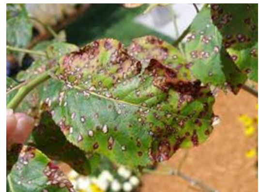
Figure 1: Marssonina leaf spot

agricultural specialists visually inspecting the affected area, which can be labor-intensive, time-consuming, and prone to human error. Furthermore, the illness can have already seriously harmed the crop by the time symptoms start to show. Farmers and agricultural specialists frequently use physical observation and visual inspection of plants as part of traditional techniques of disease identification and management. These methods are time-consuming, labor-intensive, and subjective by nature. Furthermore, they might not always be successful in detecting illnesses in the earliest stages, when intervention efforts might be most helpful. Therefore, automated and effective plant disease detection and classification technologies are desperately needed in order to supplement current techniques and offer prompt and precise diagnoses.