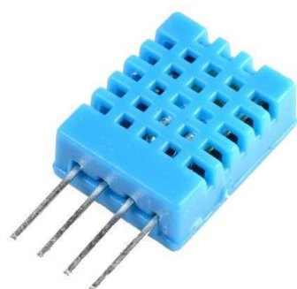
Fig:1.5 DHT-11 Temperature Humdity Sensor

The DHT11 is a commonly used Temperature and humidity sensor. The sensor comes with a dedicated NTC to measure temperature and an 8-bit microcontroller to output the values of temperature and humidity as serial data. The sensor is also factory calibrated and hence easy to interface with other microcontrollers. The sensor can measure temperature from 0^{\circ} C to 50^{\circ} C and humidity from 20% to 90% with an accuracy of \pm 1^{\circ} C and \pm 1\% . So if you are looking to measure in this range then this sensor might be the right choice for you.