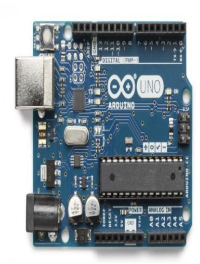
Fig:1.1 Arduino Uno

Arduino is an open-source electronics platform based on easy to use hardware and software. A developer can send a set of instructions to the microcontroller. All Arduino boards are open-source, empowering users to build them independently, and ultimately adapt them to their particular needs. Arduino/Genuino Uno board consists of an ATmega328P microcontroller chip. It has 14 digital input-output pins, 6 analog inputs, a 16 MHz quartz crystal, a USB connection, a power jack, and a reset button. The ATmega328 on the Arduino Uno comes programmed with a bootloader that allows uploading new code.