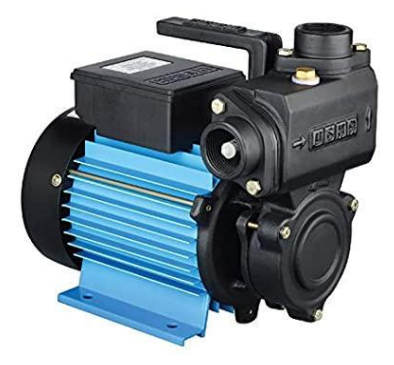
Fig:1.6 Water Motor