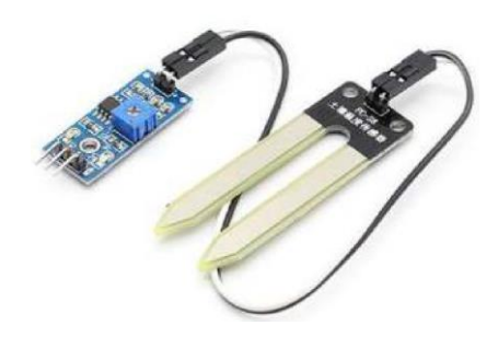
Fig: 1.3 Soil Moisture Sensor

The Soil moisture sensor is used to know the moisture level of the soil. By this value the DC pump can be controlled through ARDUINO. The moisture level differ for different plant, climatic condition the plant growth. Even high moisturizing level in the plant can affect the plant. Good moisturizing will improve nutrient uptake. The difference for watering the plants will be based on the type of plants. This Moisture Sensor can be used to detect the moisture of soil or judge if there is water around the sensor, let the plants in your garden reach out for human help. They can be very to use, just insert it into the soil and then read it. If you are a gardener, you can use this sensor to know when your plants need to be watered.