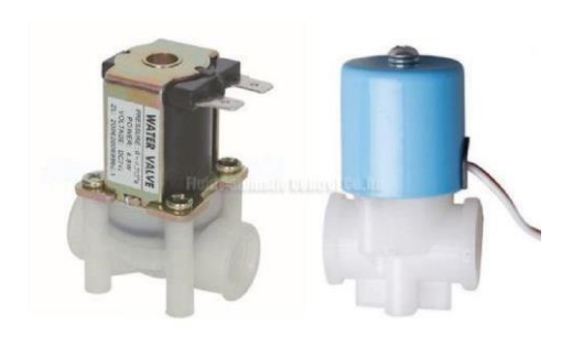
Fig:1.4 Solenoid Valve