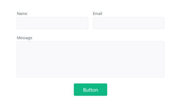
Fig. 5. Contact page

Whatever cardigan tote bag tumblr hexagon brooklyn asymmetrical gentrify.