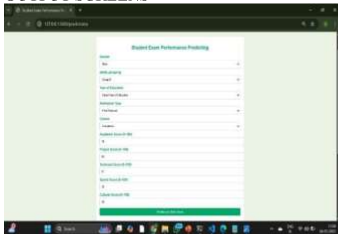
Figure 2: Home Page