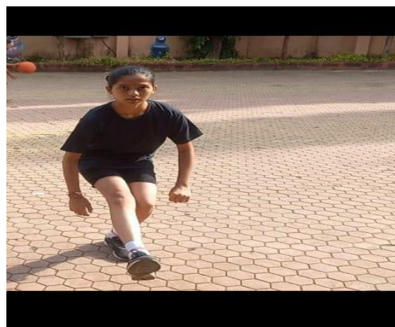
Fig -1: Figure