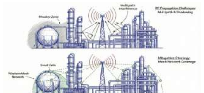
Figure 2: Mitigation strategy by using a "mesh" of small cells to fill coverage gaps.

Dense pipe racks act as nested Faraday cages, preventing RF signals from passing through. This creates deep shadow zones where coverage drops sharply. As a result, O&G facilities require a much higher density of Small Cells than logistics warehouses. 5G networks in refineries are often limited by interference rather than noise, requiring careful inter-cell interference coordination [12].