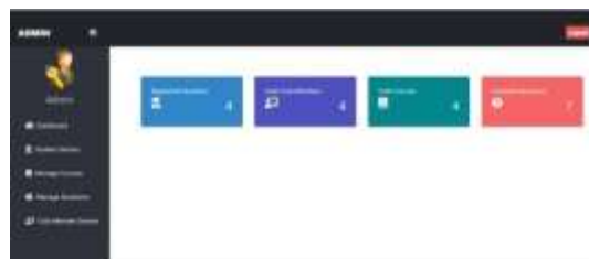
Fig. 3. Admin-Dashboard

The Procto system follows a modular architecture integrating frontend, backend, AI-based proctoring, and database management to ensure secure and efficient online examination monitoring. The system is designed to be scalable, real-time, and user-friendly, supporting seamless interaction between students, professors, and the proctoring AI.