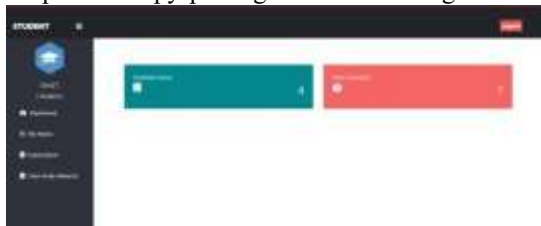
Fig. 2. System Architecture

(c) Tab Switching and External App Monitoring The system continuously monitors browser activity and detects tab switching attempts. The number of prohibited key presses (Ctrl, Alt, etc.) is recorded to prevent copy-pasting or screen sharing.