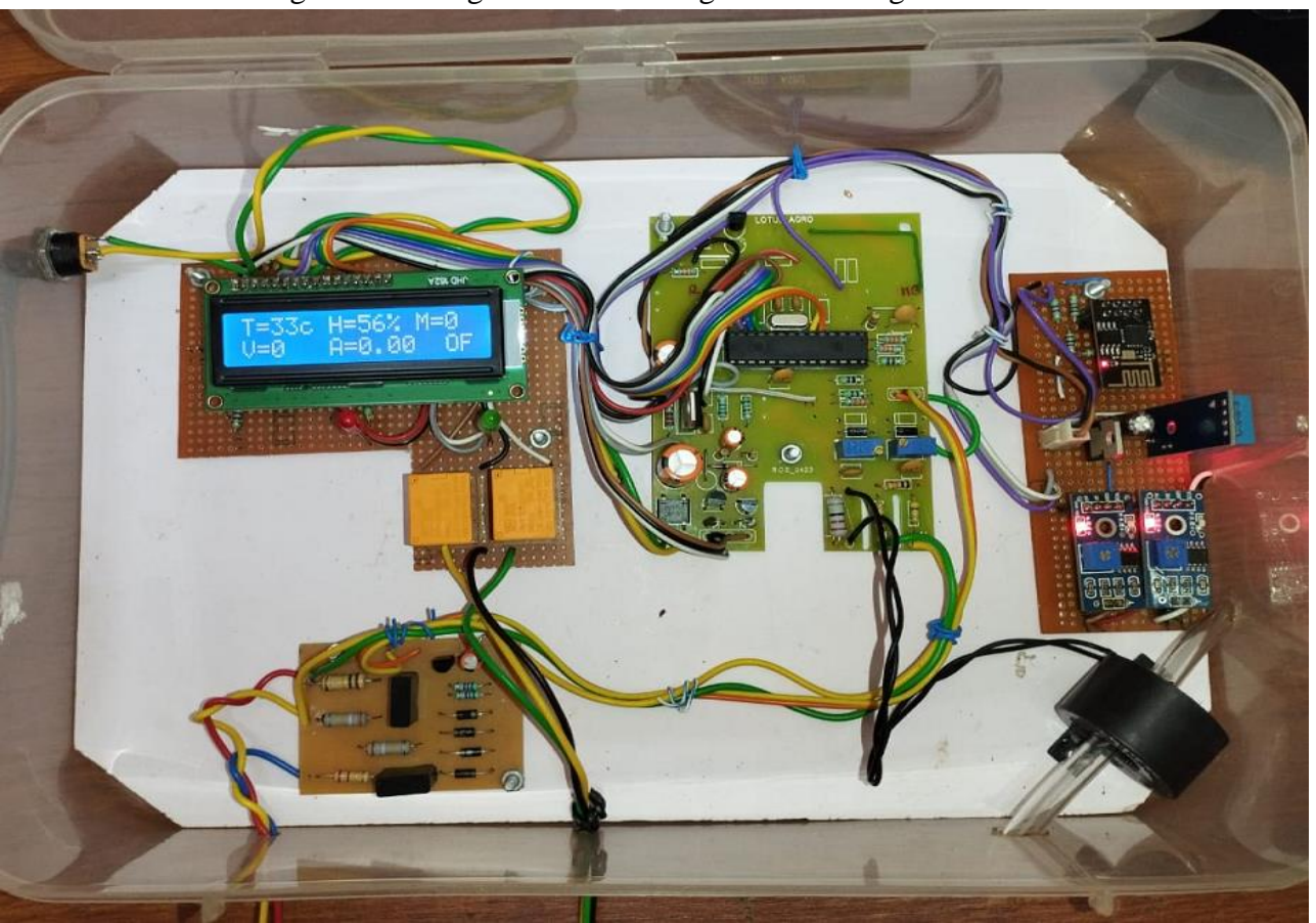
Fig.3 Hardware of the system