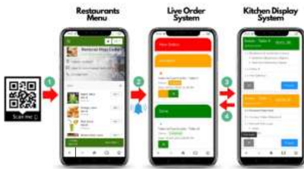
Figure 2: Order Flow