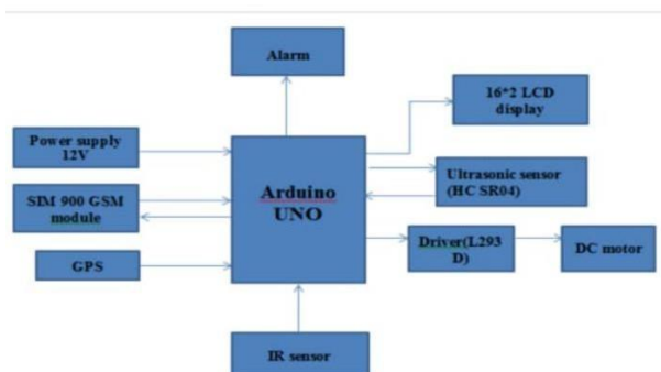
Fig -1: Block diagram